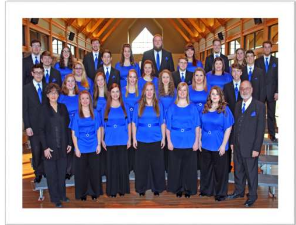
The Williams Baptist College Singers

Come celebrate the Risen Savior with the music ministry of PABC! We'll be singing many of the Easter songs you know and cherish. Invite your family and friends on this special day!